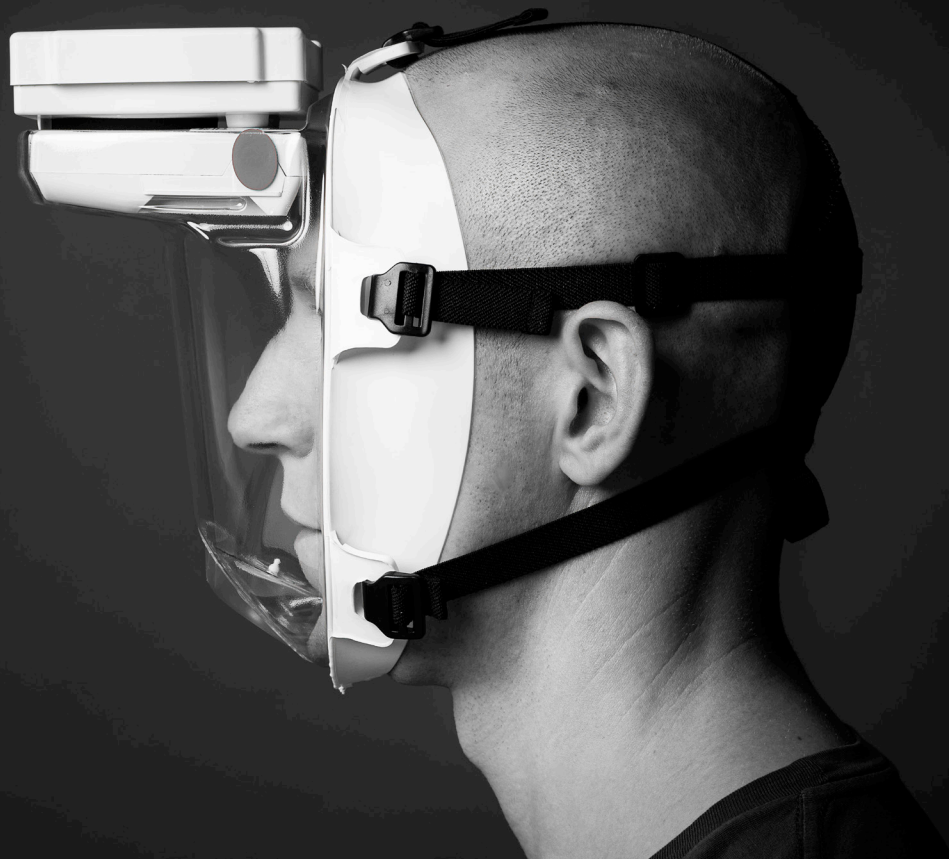
TIKI SIZE GUIDE EN 1090-41